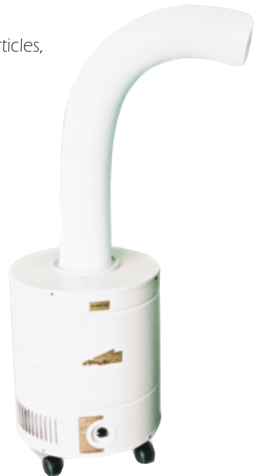
5000W - Vocarb

Also available: 5000 W-D with 22 lbs. of carbon